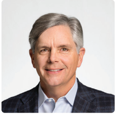
H. Lawrence Culp, Jr. Chairman and CEO, GE; CEO, GE Aerospace